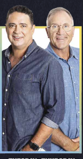
TUESDAY - THURSDAY