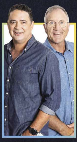
TUESDAY - THURSDAY